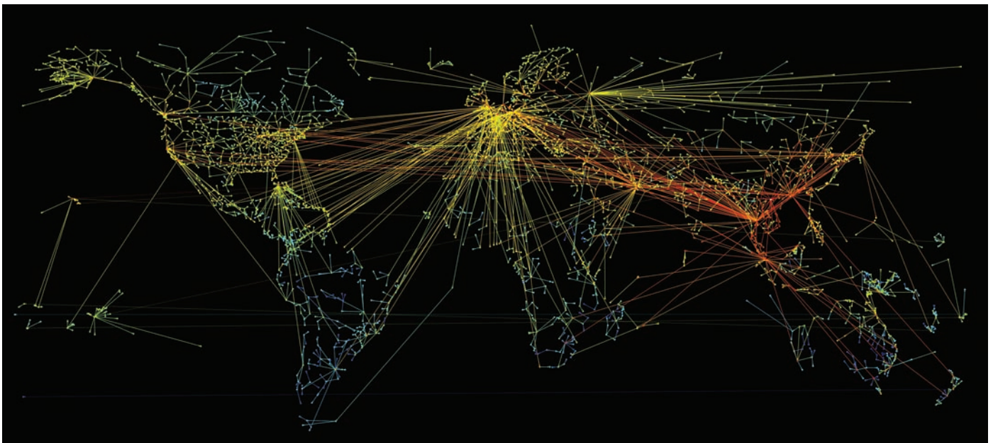
Fig. 2. Epidemic invasion tree obtained from the simulations of a pandemic originating in Hanoi, Vietnam. The nodes identify 3200 populations worldwide, and the directed links indicate the path along which the epidemic has moved

However, the biggest challenge in providing a holistic description of multiscale networks is the necessity of simultaneously dealing with multiple time and length scales. The final system’s dynamical behavior at any scale is the product of the events taking place on all scales. The single agent spreading a disease or single node of the Internet that fails are apparently not affected by